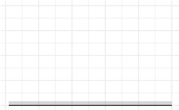
Stable to death